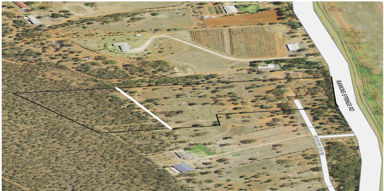
Figure 2: Aerial Image from 2016 with Zone boundary shown

Since purchasing the land, it is understood the current landowners have cleared approximately 0.2ha in anticipation of constructing of a dwelling on the site and to provide access to elevated lands. Clause 7.2 of the Biodiversity Conservation Regulation 2017 allows some clearing of native vegetation on land under certain thresholds without consent – based on the size of the lot up to 0.5ha could be cleared without consent.